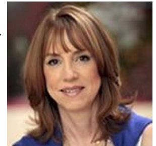
Author Lisa See