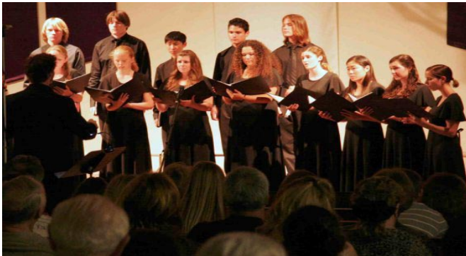
North Coast Singers